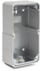
On Wall Back Box